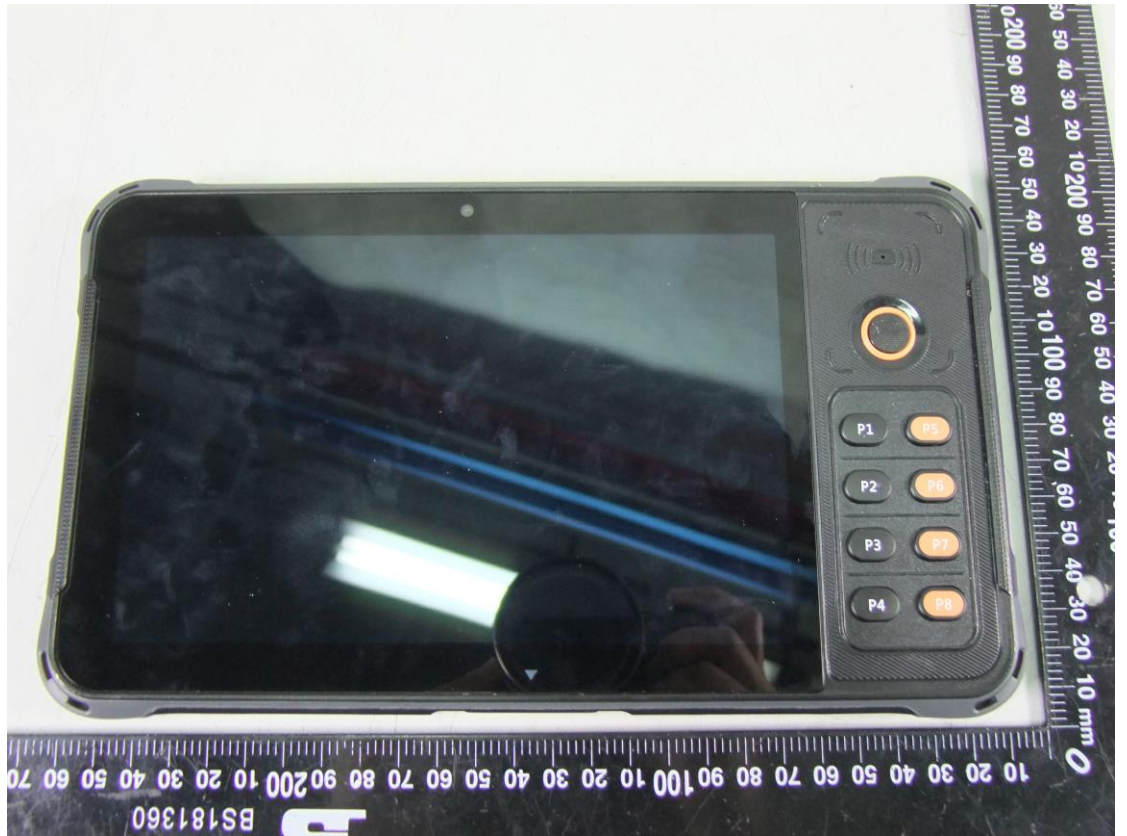
Photo 2 Appearance of EUT