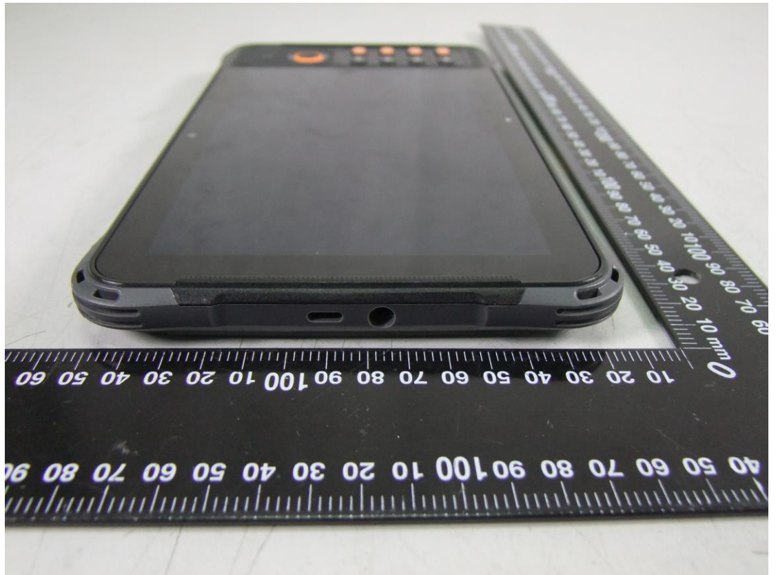
Photo 6 Appearance of EUT