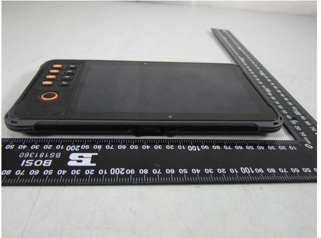
Photo 4 Appearance of EUT