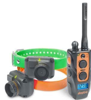
Black color of the case