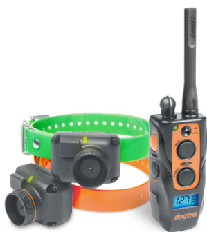
Orange color of the case