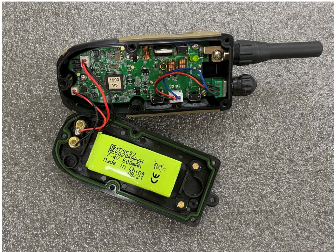
[ Inside View ]