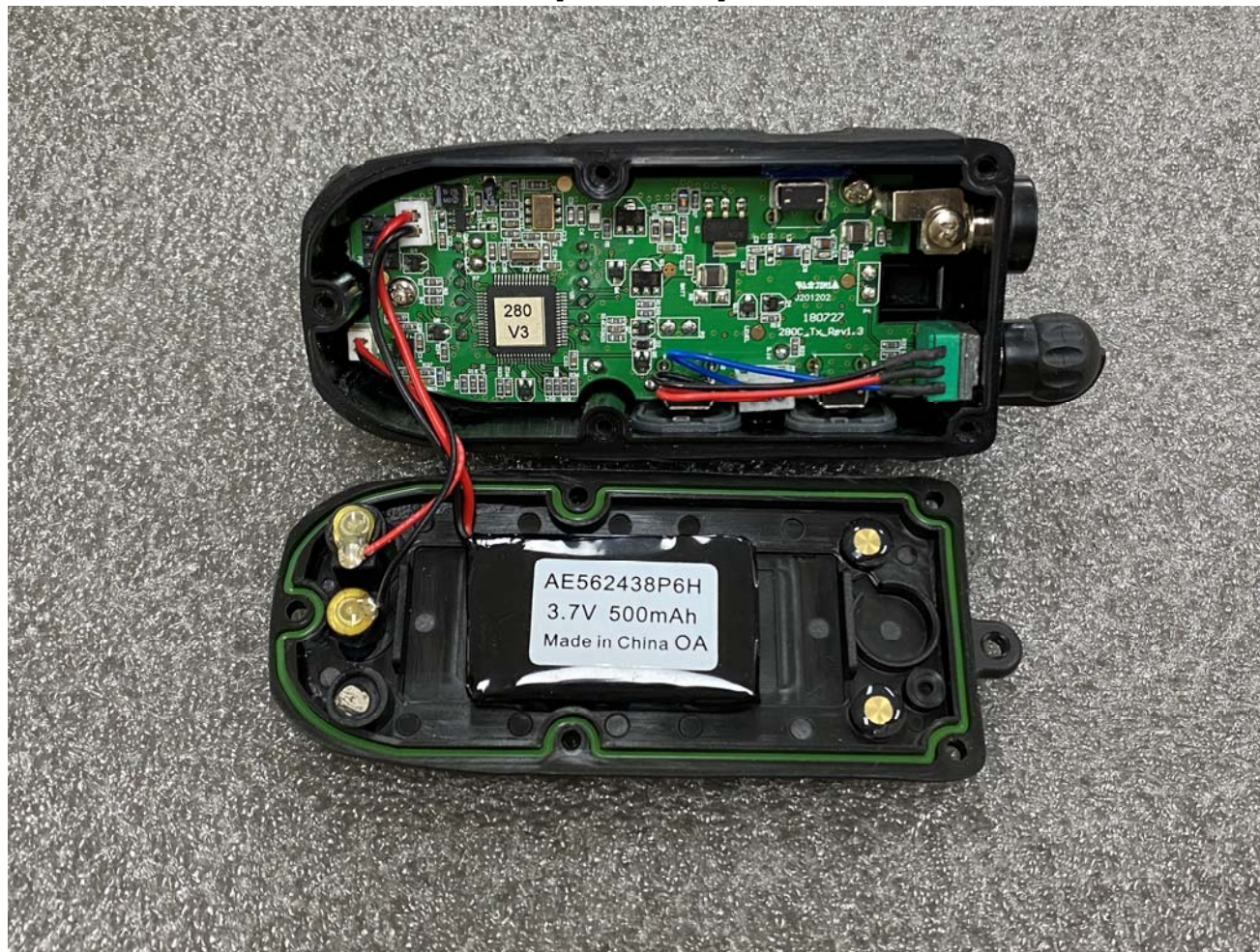
[ Inside View ]