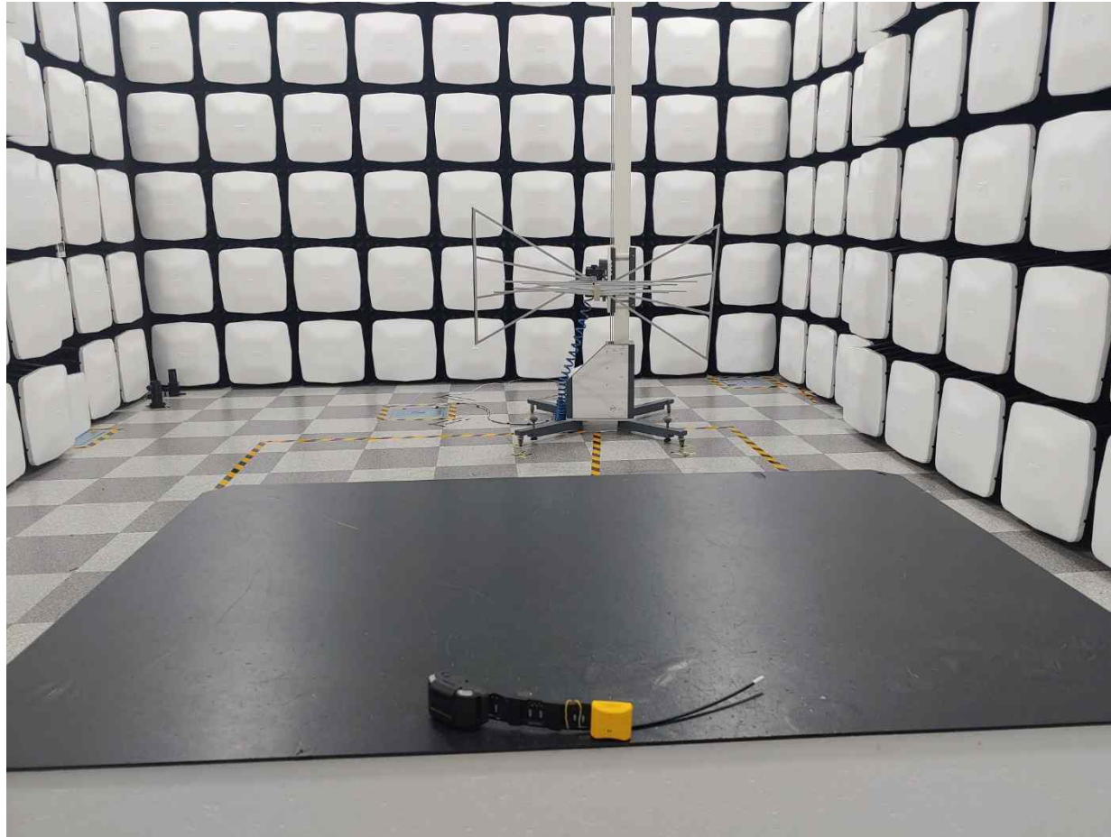
Radiated RF measurement (30 MHz ~ 1 GHz)_DSS