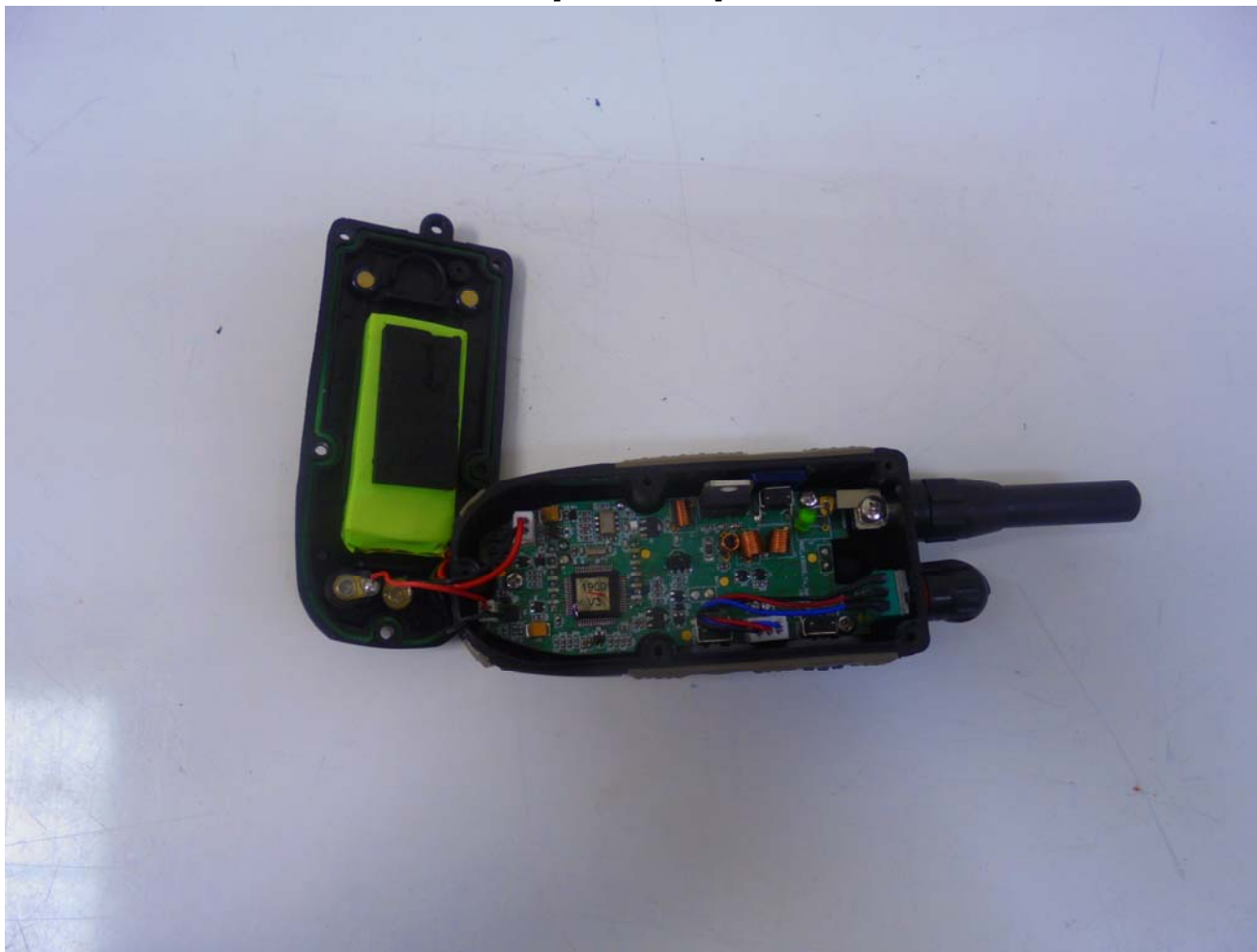
[ Inside View ]