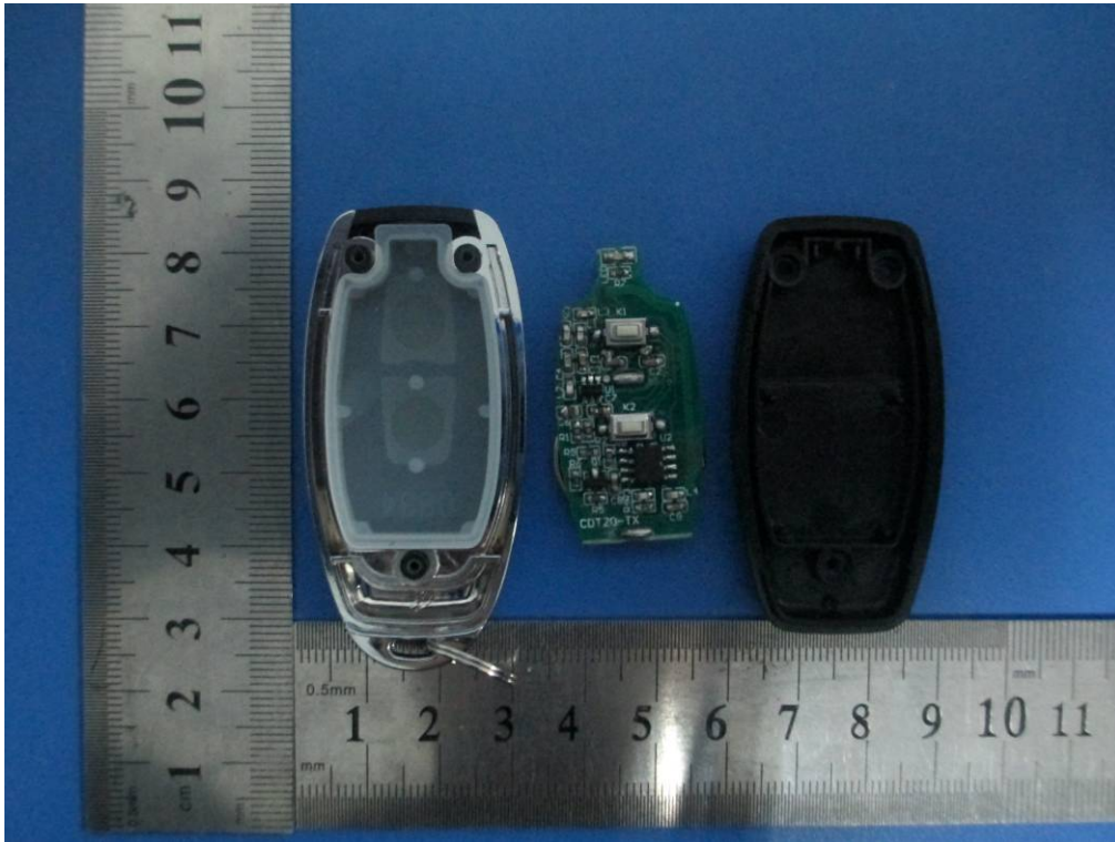
EUT – Uncover Front View