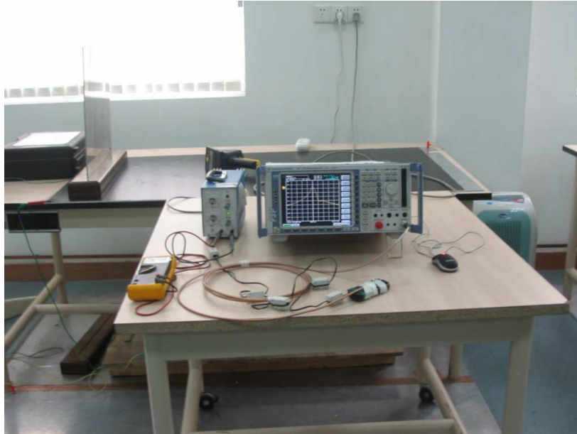
Photograph 2: Set-up for bandwidth measurement