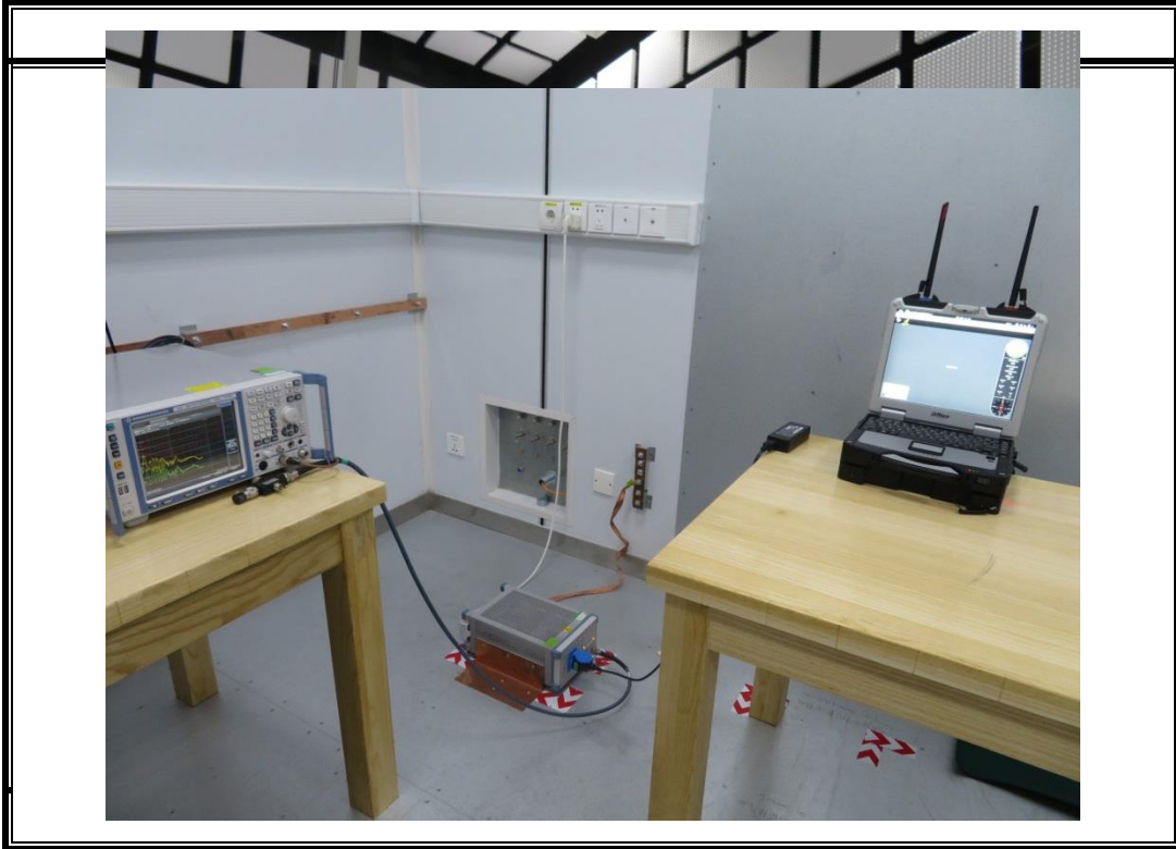
POWERLINE CONDUCTED EMISSIONS MEASUREMENT SETUP RADIATED RF MEASUREMENT SETUP (Below 30MHz)