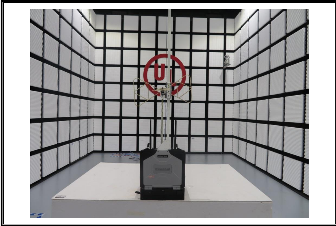
RADIATED RF MEASUREMENT SETUP (ABOVE 1 GHz- X axis)