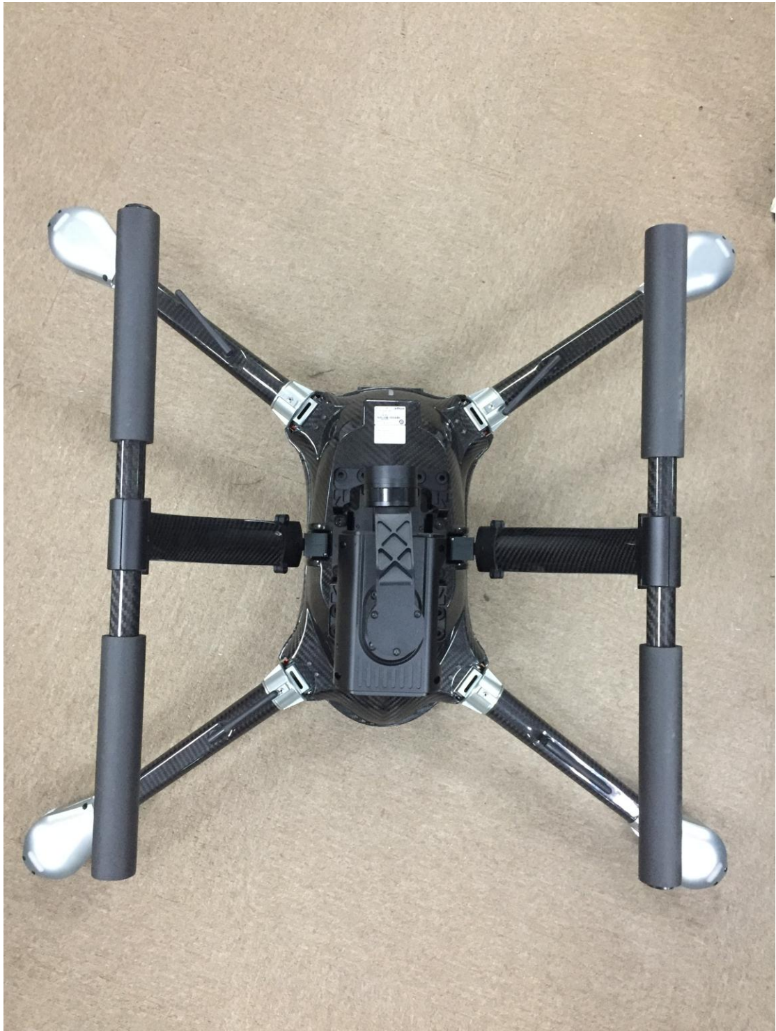
label on the Aircraft X820