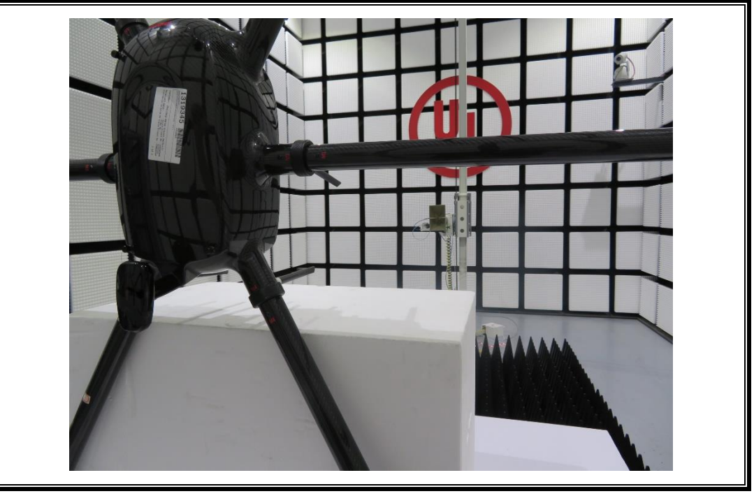
RADIATED RF MEASUREMENT SETUP (ABOVE 1 GHz- Z axis)