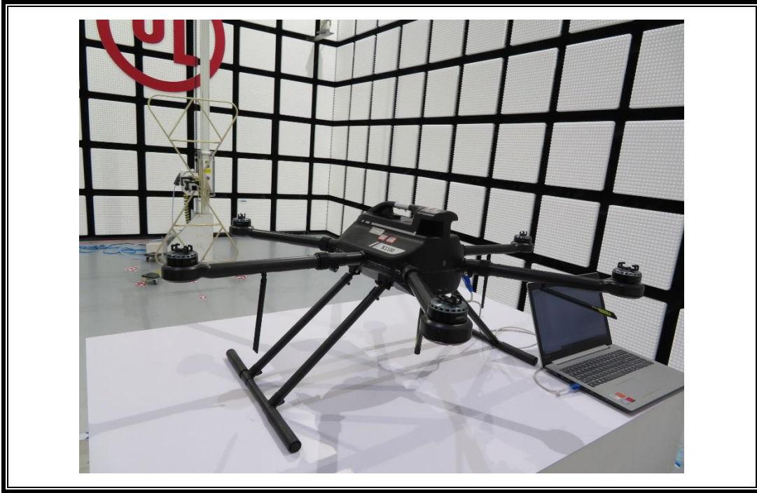
RADIATED RF MEASUREMENT SETUP (ABOVE 1 GHz- X axis)