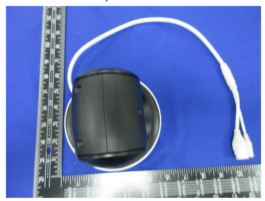
Left View of EUT