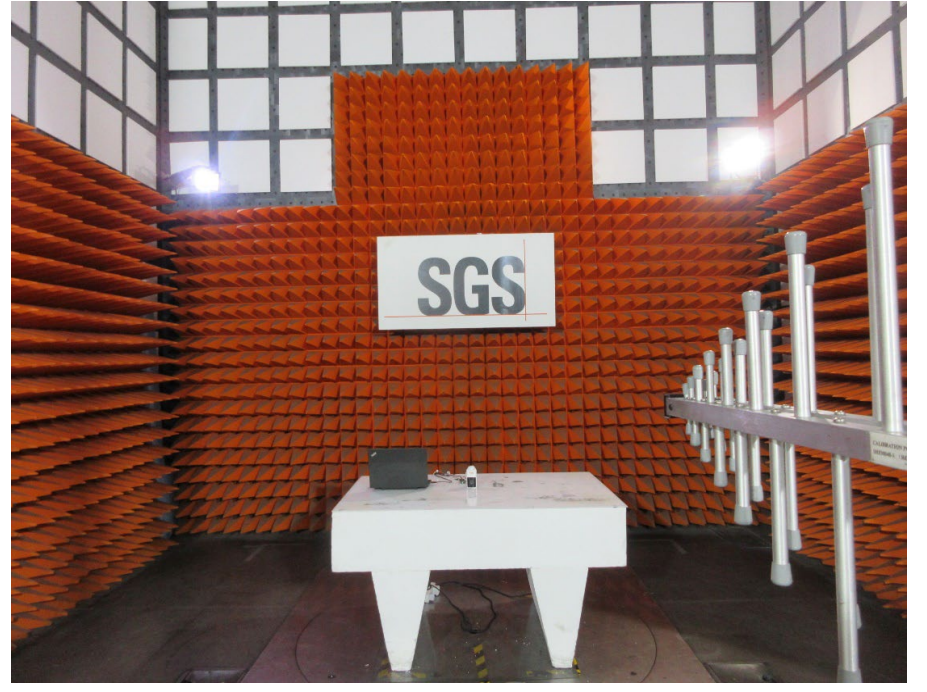
Radiated Spurious Emissions Below 1GHz