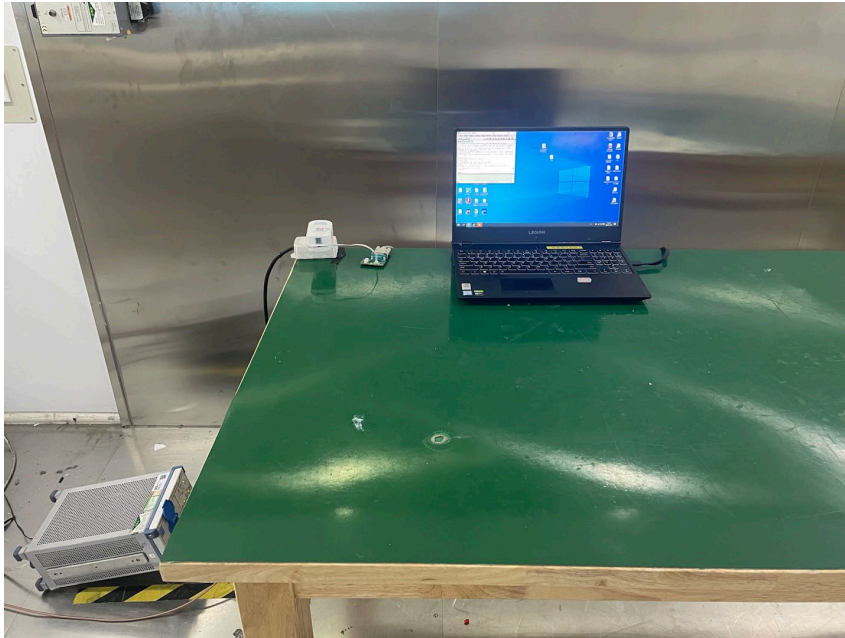
RF conducted setup