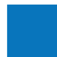
Pantone 300C Reference Color for Blue SBP