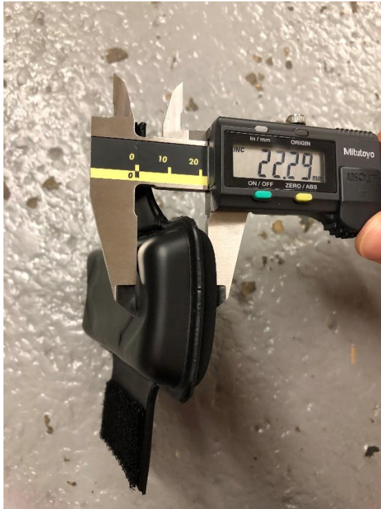
Figure 2 Thickness of thinnest foam pad

Therefore, in compliance with KDB 447498 v06 section 4.1 f, the test separation distance of 20mm for the device to demonstrate SAR or MPE compliance is sufficiently conservative to support the operational separation distances required by the device and its antennas and radiating structures.