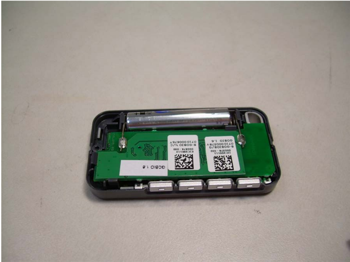
Cover Removed Showing PCB Stack in the Case