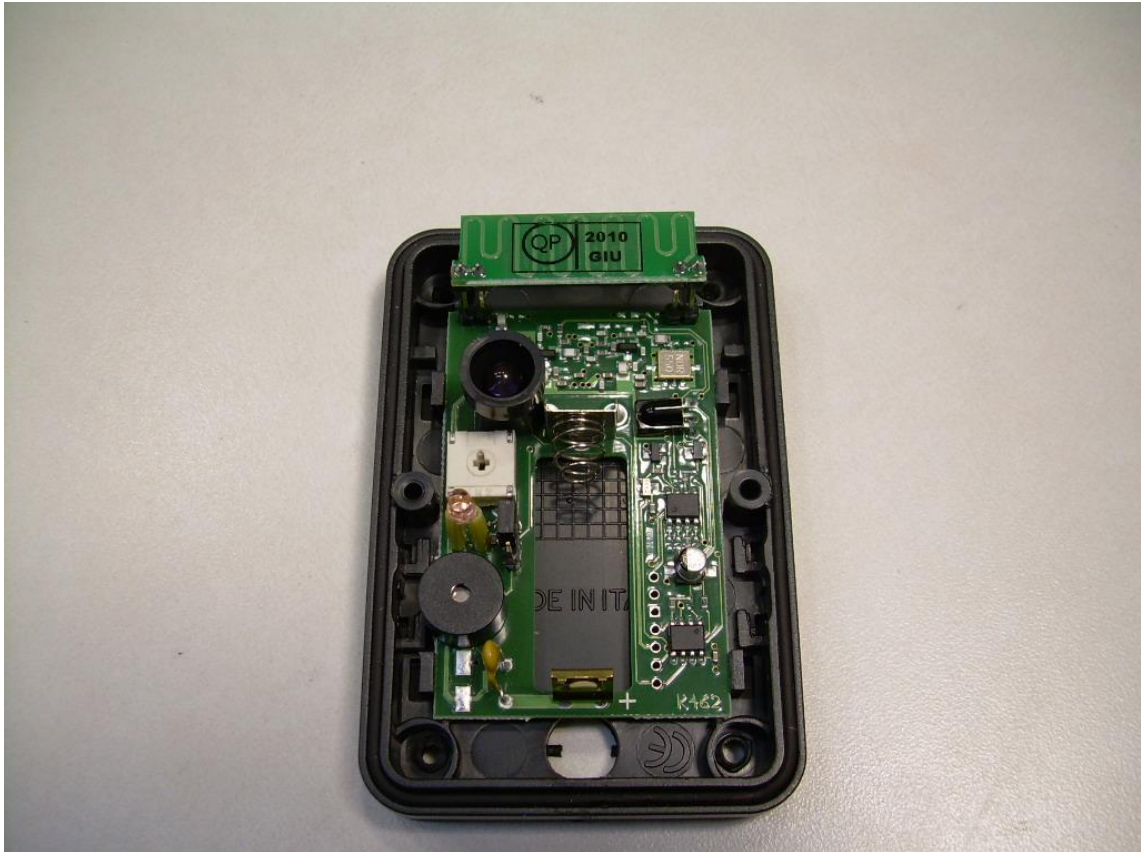
View of the EUT with Front Housing Removed