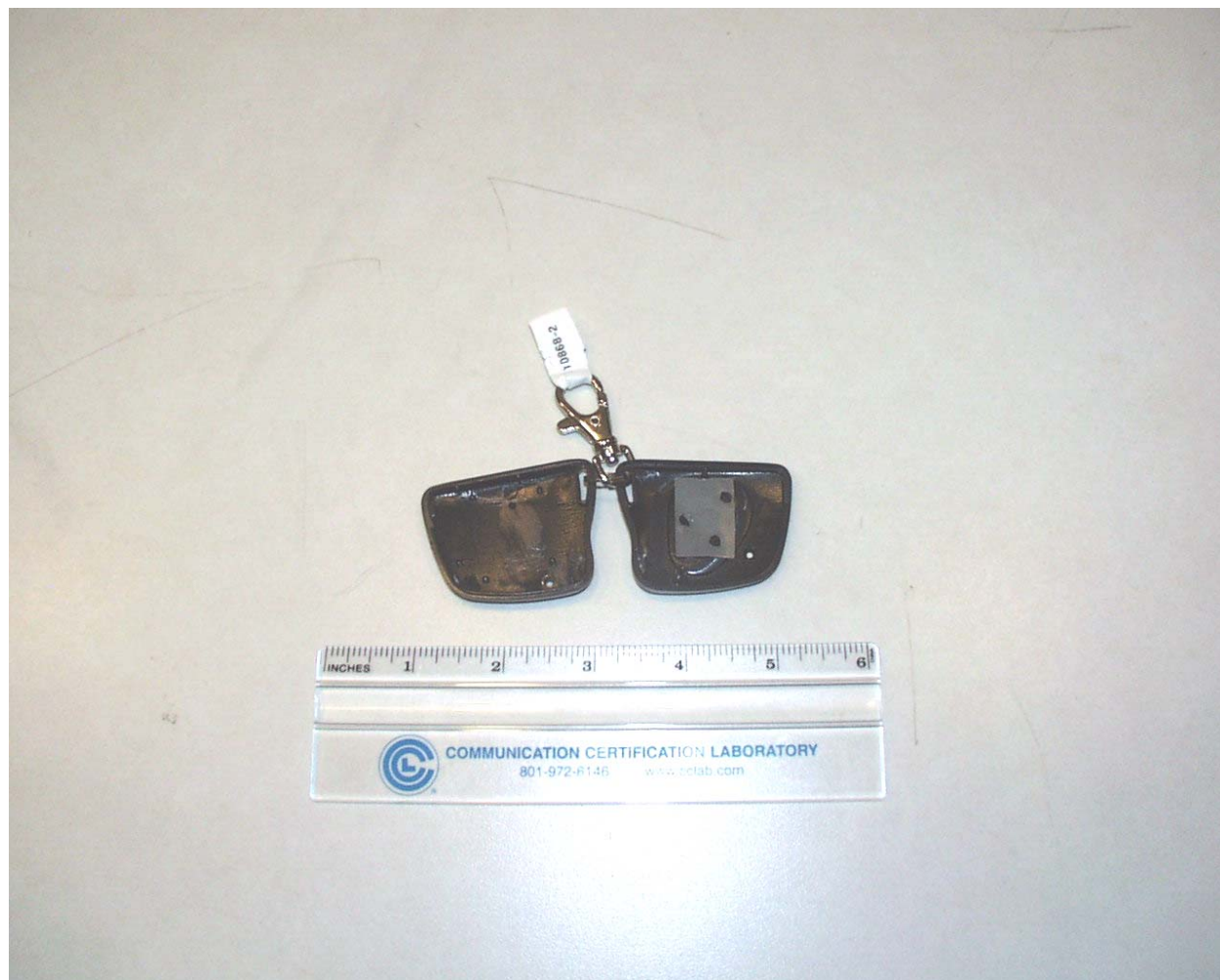
View of the Inside of the Case