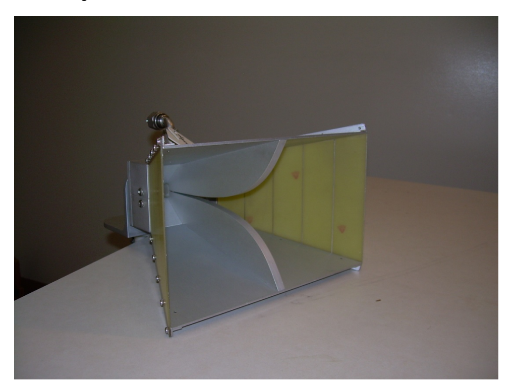
Pyramidal Horn Antennas