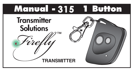
Thank you for choosing a Transmitter Solutions product. Please read this manual carefully before using the product. Made in China. Copyright © 2010 by Transmitter Solutions.