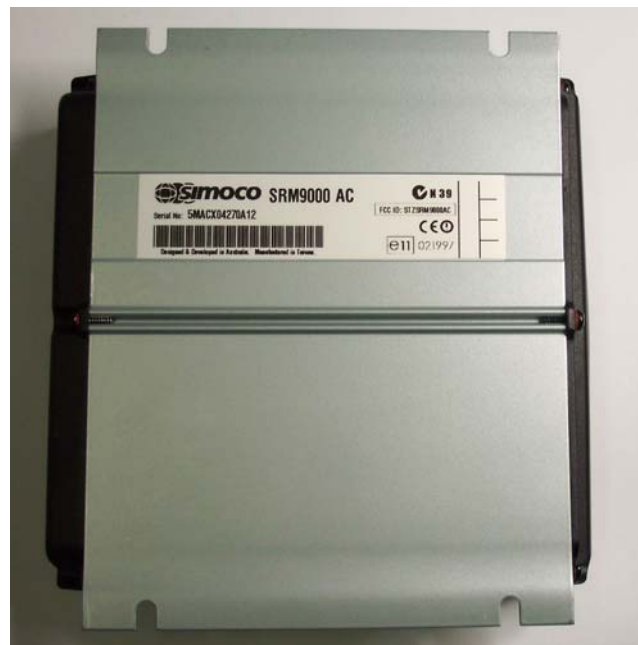
RF Exposure label location