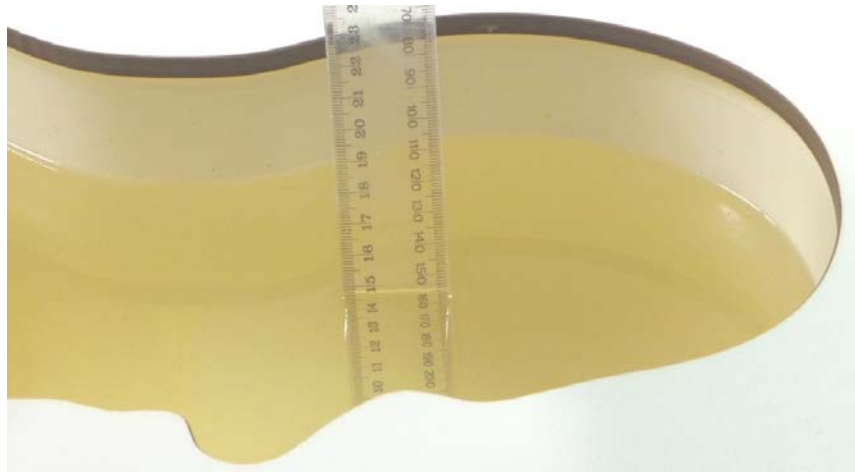
Photo of liquid Depth in SAM Phantom

During the SAR measurement process the liquid level was maintained to a level of 15cm with a tolerance of \pm 0.5\text{cm} . The following photo shows the depth of the liquid maintained during the testing.