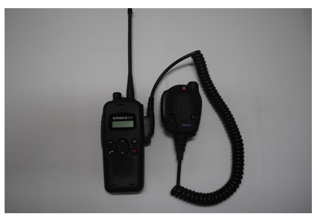
Apply to SDP650 and SDP660