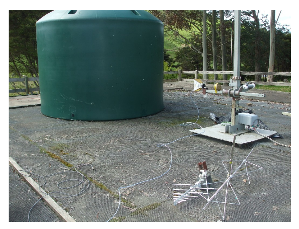
Test sample in located in the green shed

Radiated emissions test set up photos - Above 30 MHz