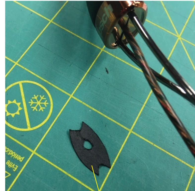
Die cut label is adhesive on side 1 and has black flocking on side 2.