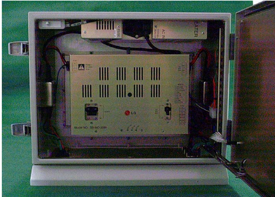
< The Inside of PSU Box >