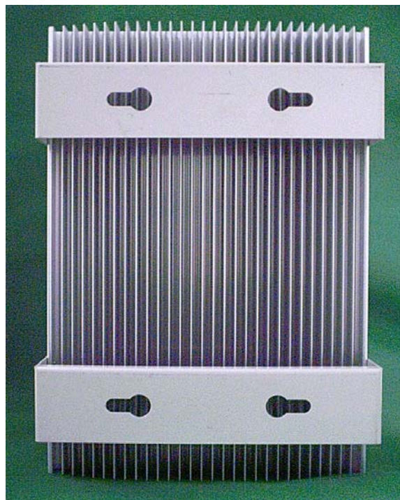
< Rear View >