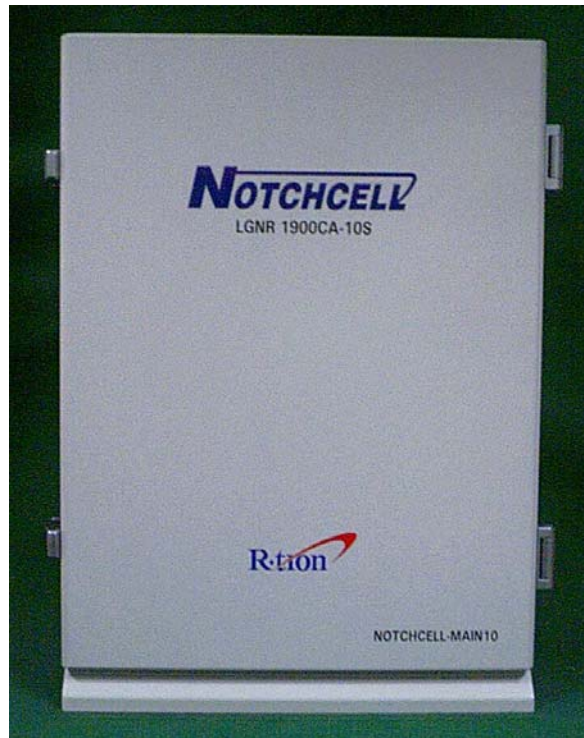
< Front View >