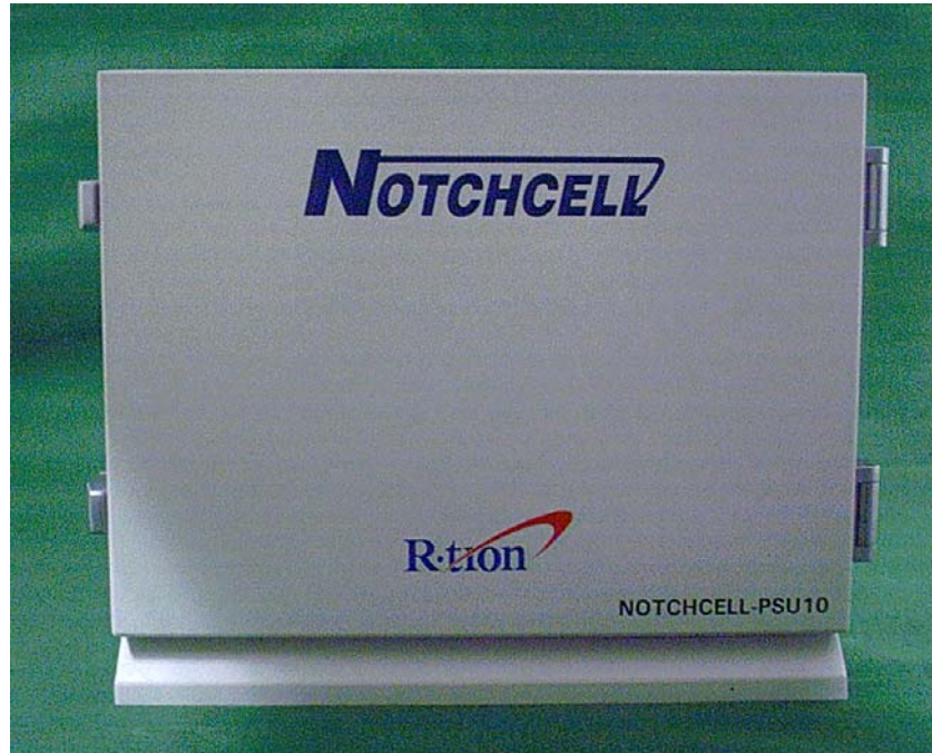
< Front View >