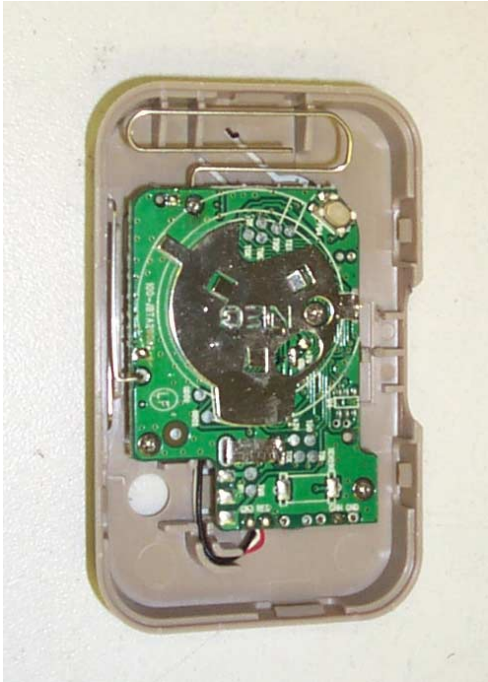
7.3 Cover Open View