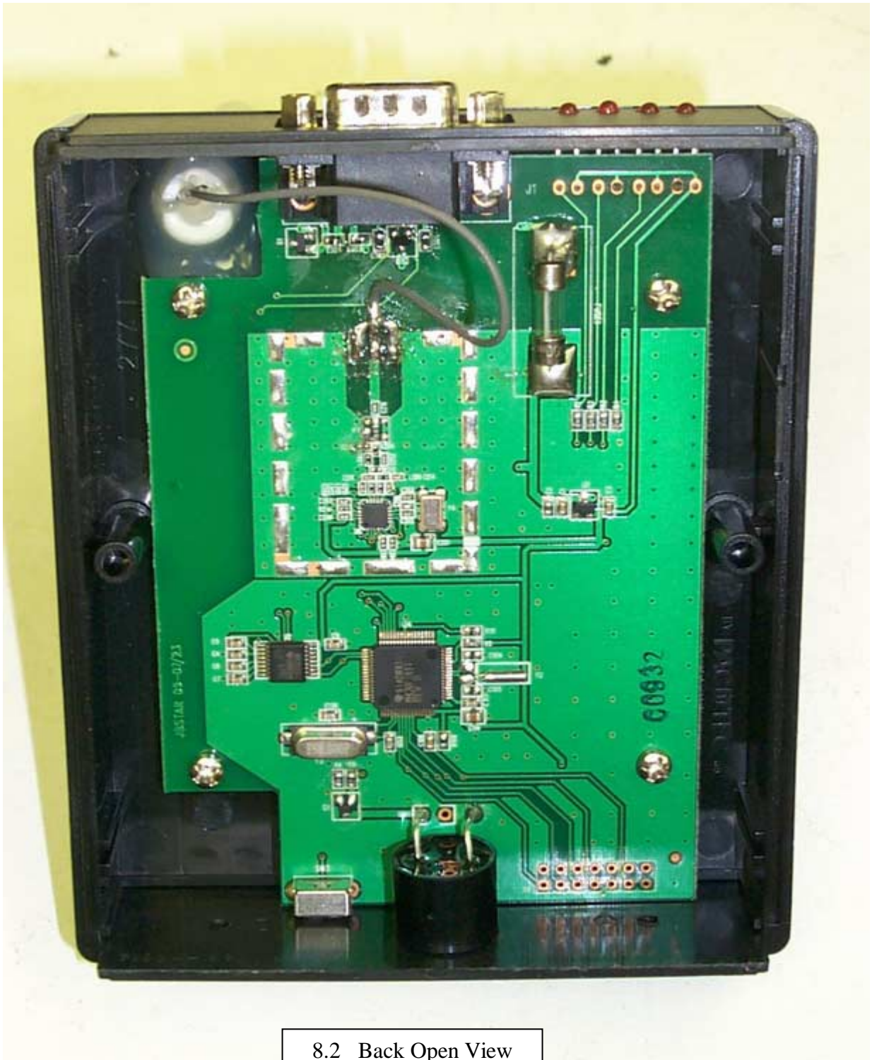
8.2 Back Open View