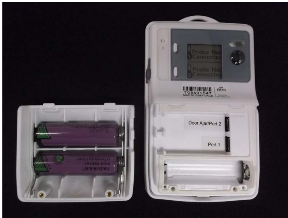
1 Front View