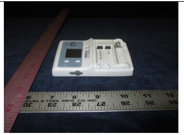
2 Back/Side View