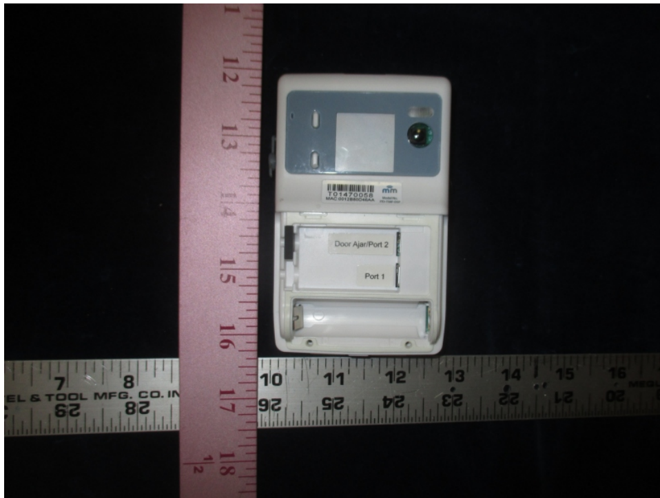
(Port #1, Port #2 are for probe connections only by using USB connection style.)