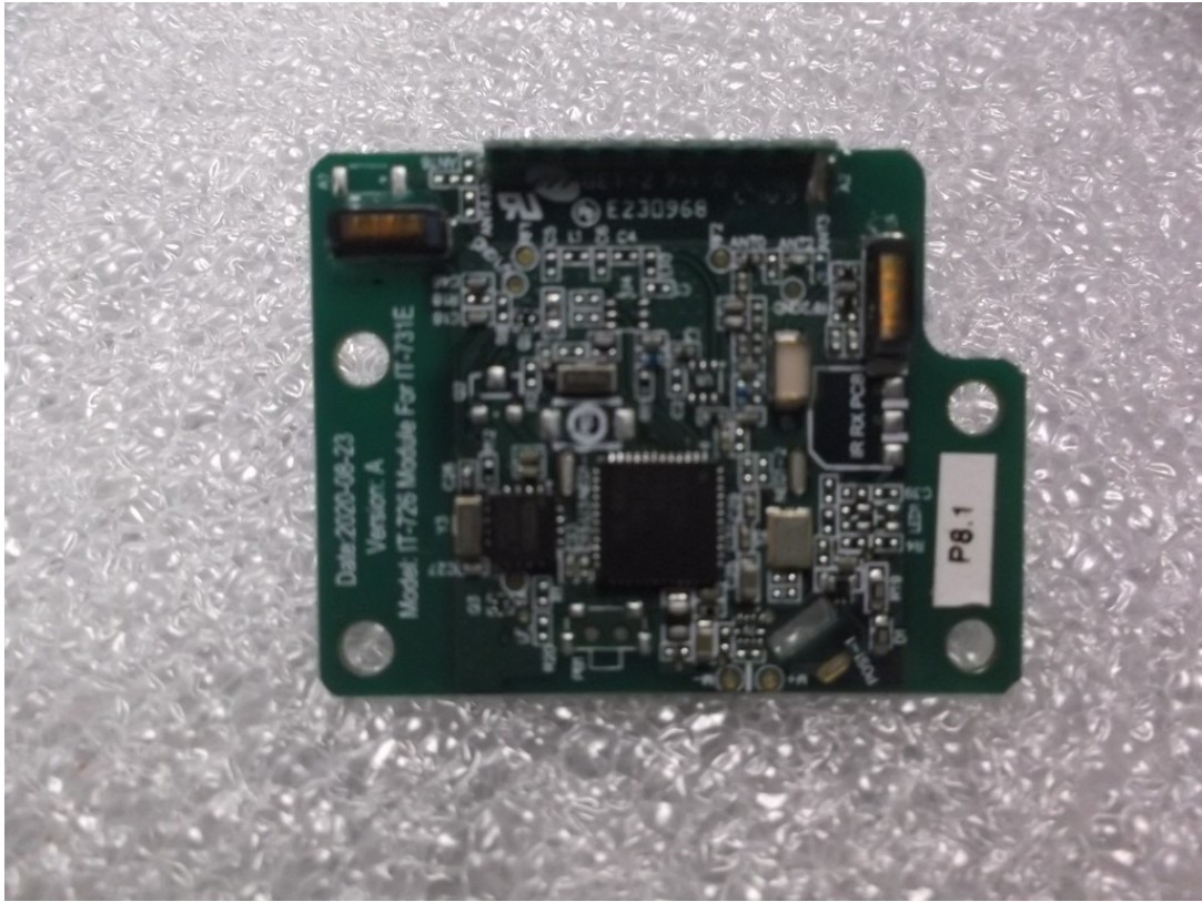
RF Section Components Side