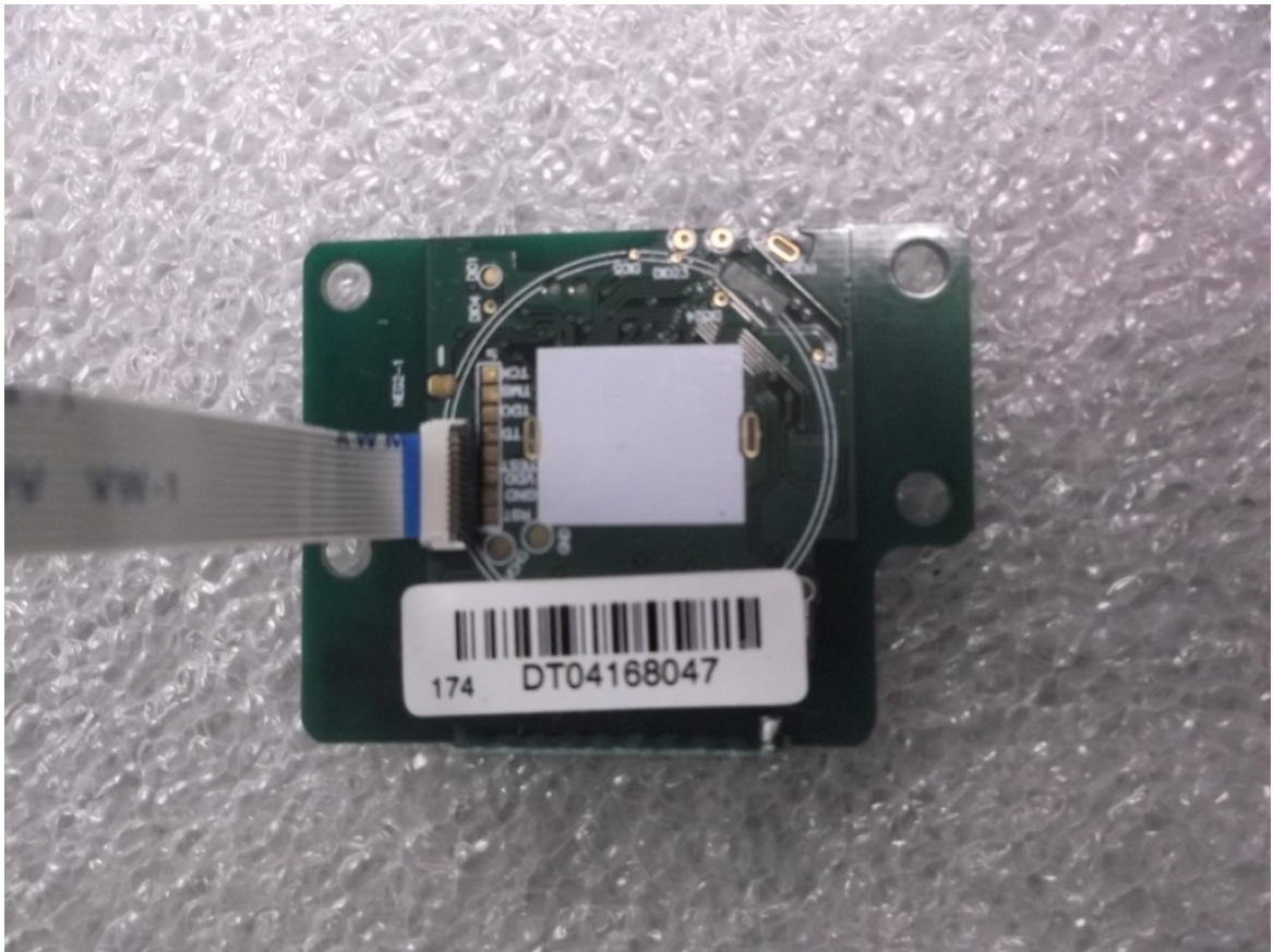
RF Section Foil Side