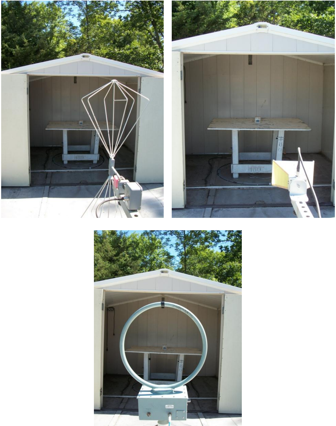
Figure 3.1 Radiated Test Setup