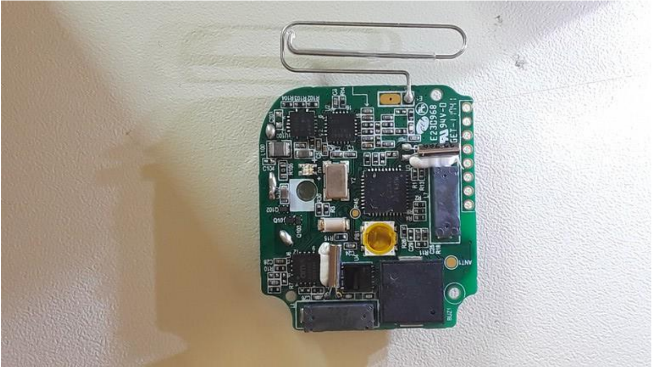
7.3 PCB Front View