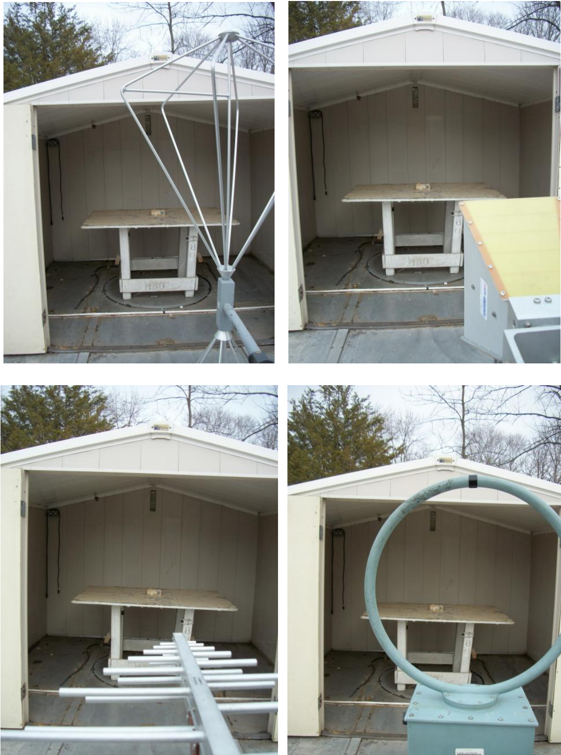
Figure 3.1 Radiated Test Setup