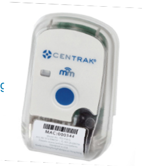
MultiMode Asset Tag