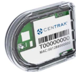
900 MHz Mini Asset Tag