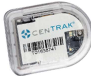
900 MHz Micro Asset Tag