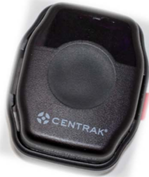
Orion MultiMode Asset Tag