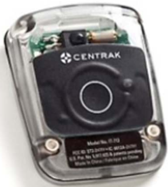
900MHz Asset Tag