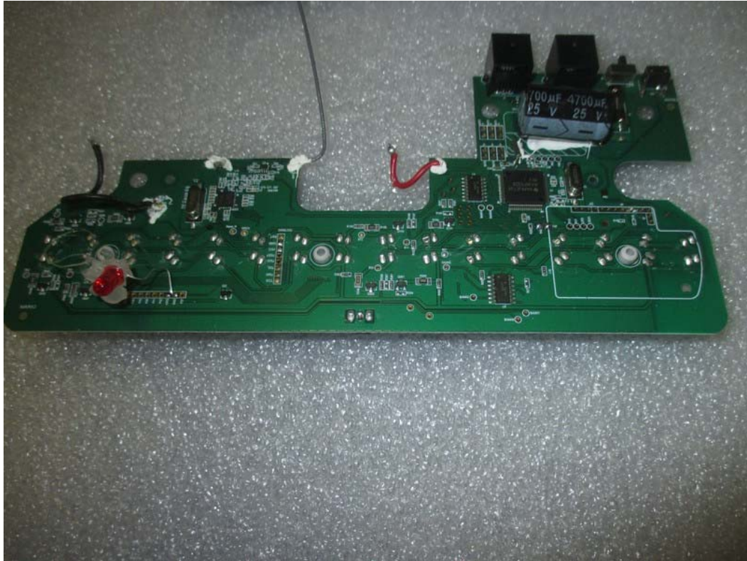
7.4 PCB Component Side View