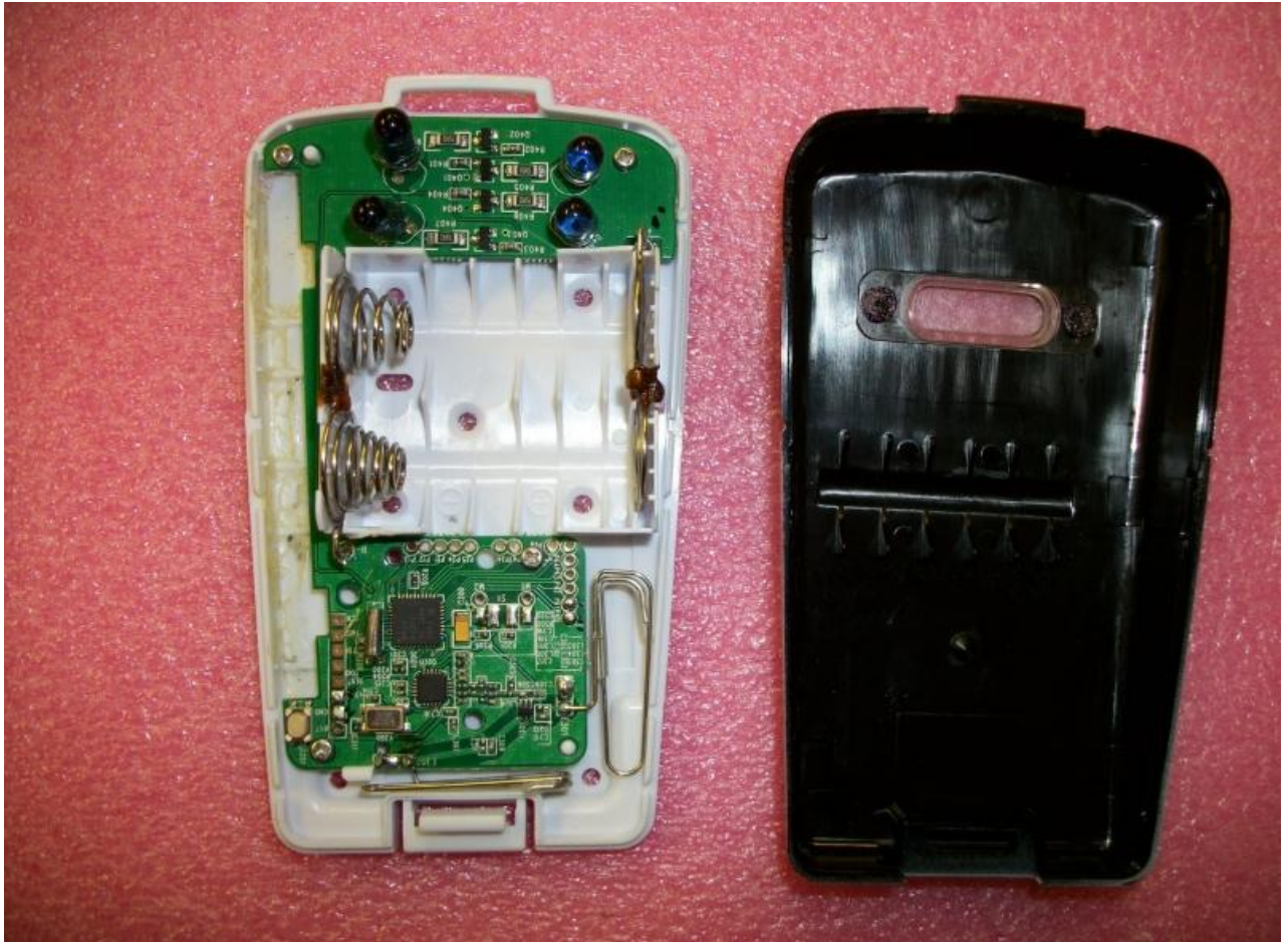
7.3 Inside View