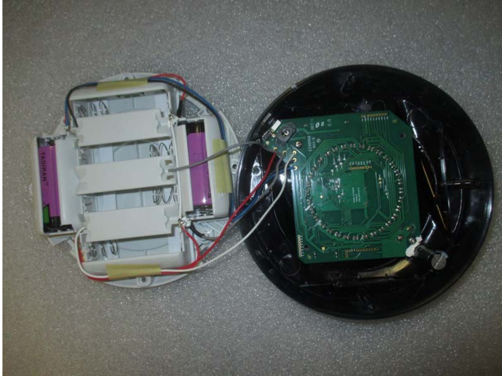
7.3 EUT Inside View