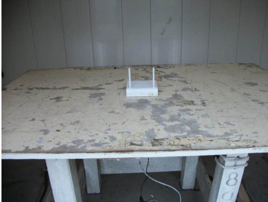
AC/DC Adaptor mode