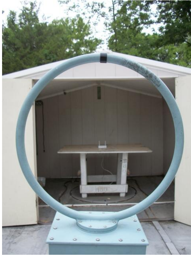
Figure 3.1 Radiated Test Setup