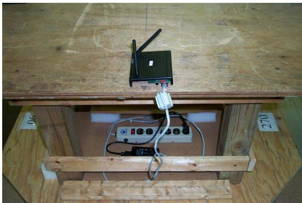
Figure 3.1 Radiated Test Setup ( Power option: AC/DC Adaptor or Power Ethernet)