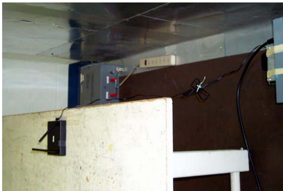
Figure 3.2 Conducted Test Setup ( Power option: AC/DC Adaptor)