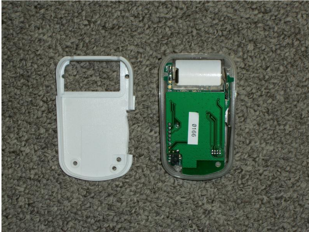
7.3 Inside View