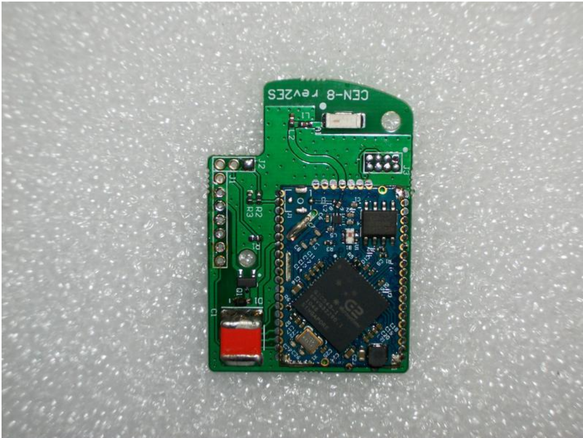
7.6 PCB_2.4G MHz_ Component Side View