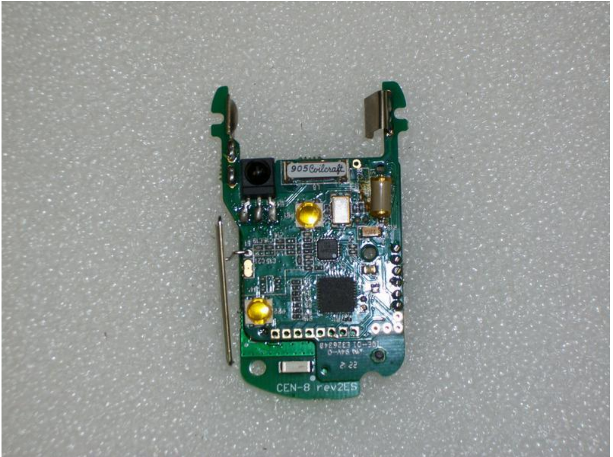
7.4 PCB_900MHz_Component Side 1