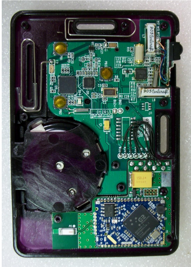
7.3 Inside View