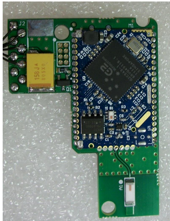
7.4 PCB Component Side