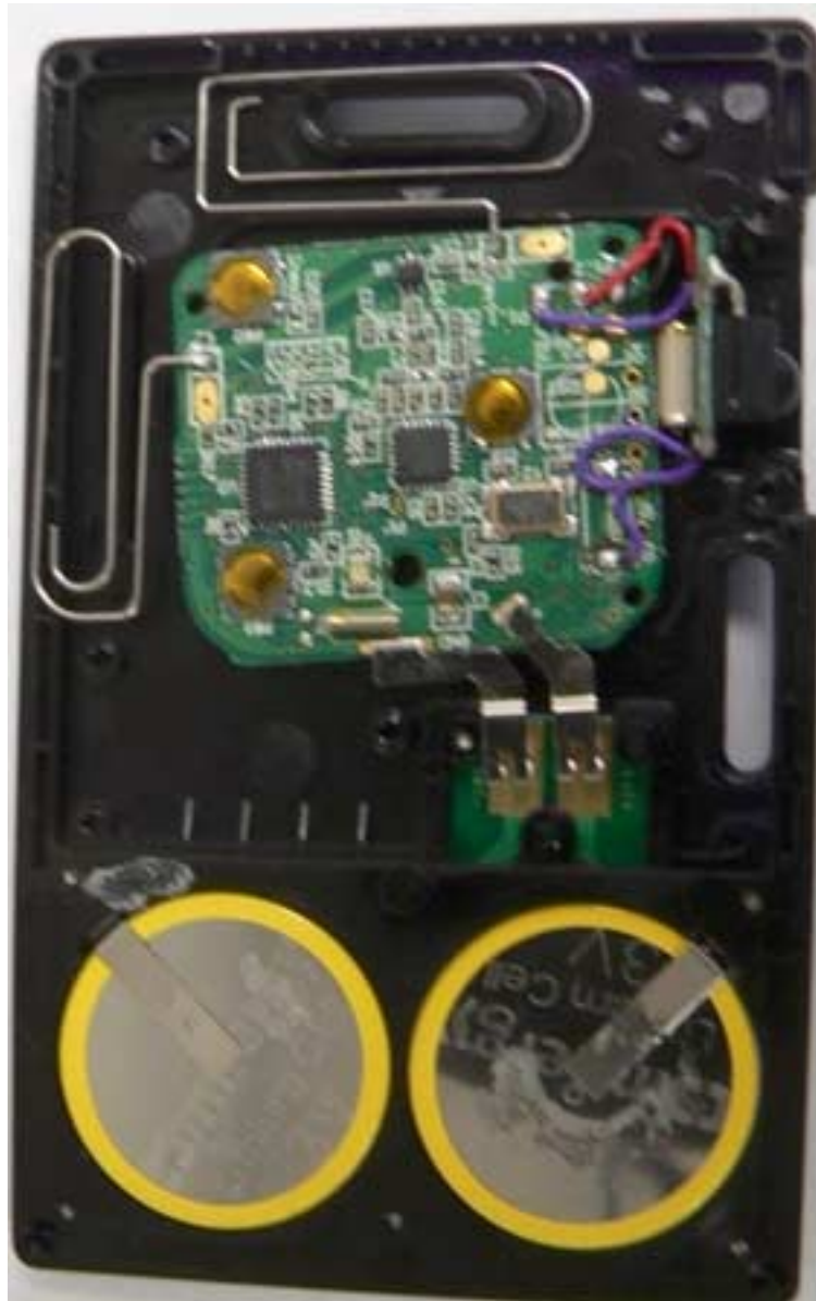
7.3 Inside View