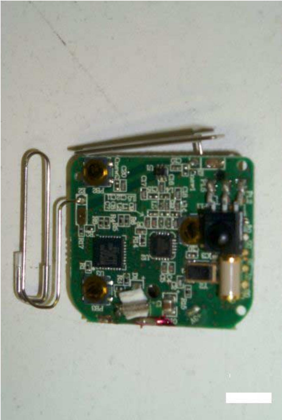
7.4 PCB Component View