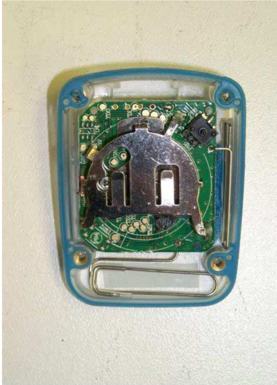
7.3 Inside View