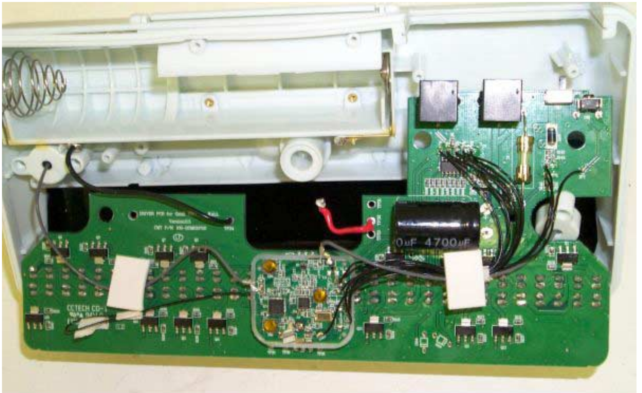
7.4 PCB Component View