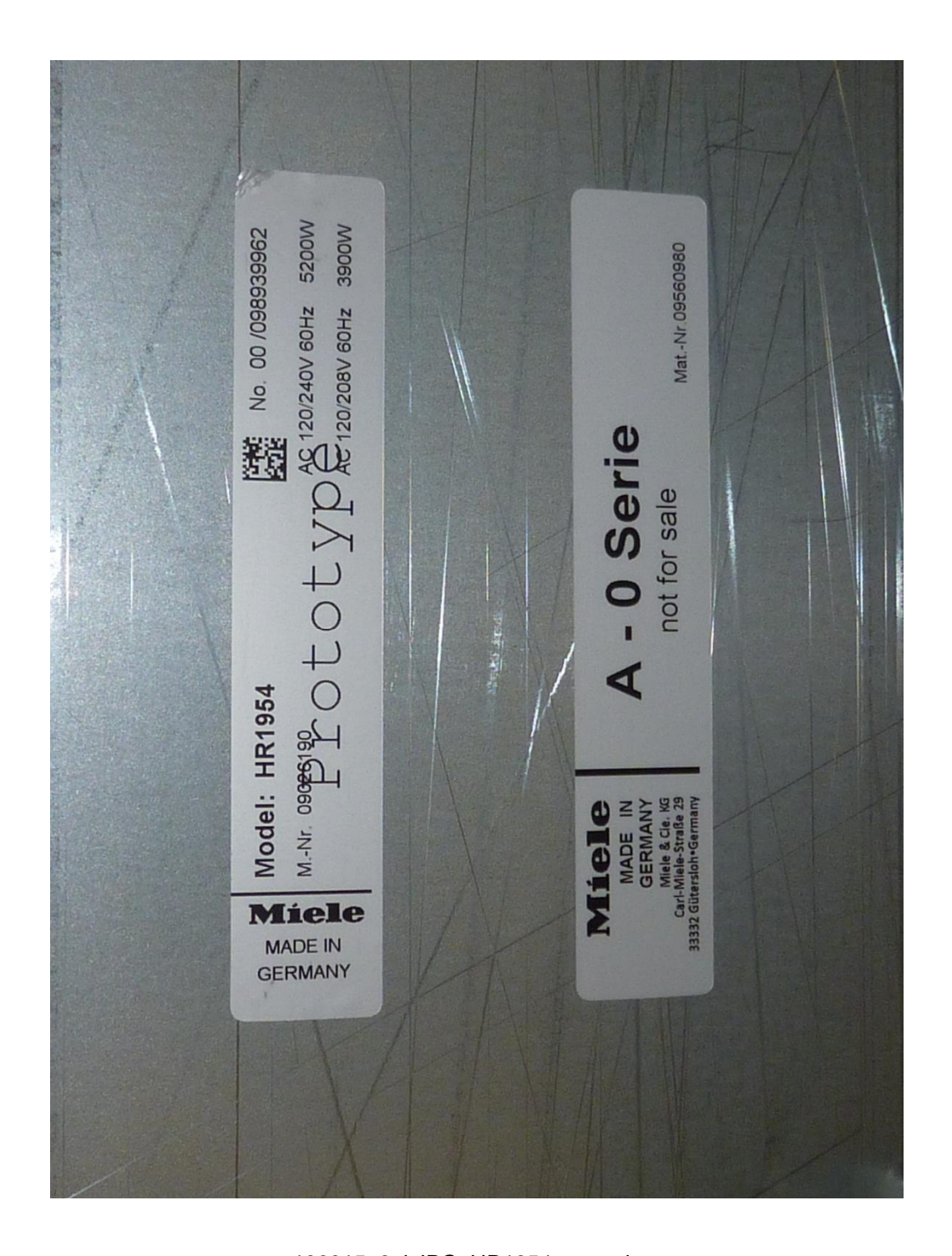
136015_3_j.JPG: HR1954, type plate

Examiner: Thomas KÜHN Date of issue: 30 October 2014 Test Report No.: F136015E4, 3<sup>rd</sup> version Order No.: 13-116015