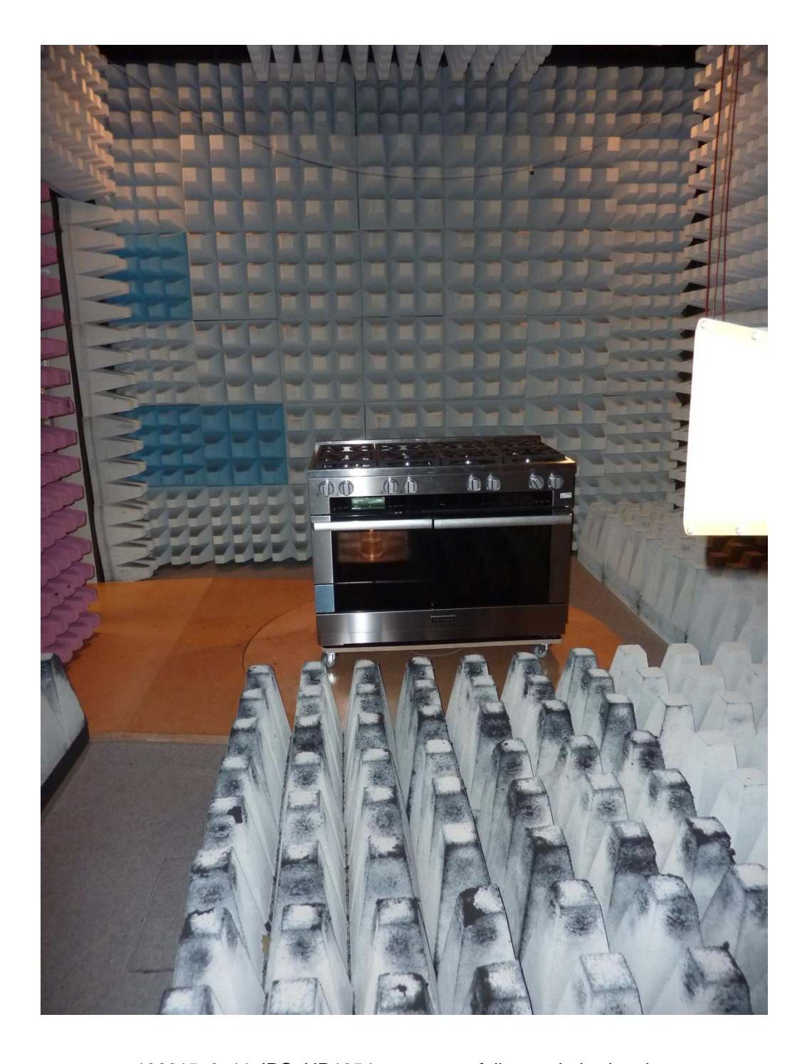
136015_3_11.JPG: HR1954, test set-up fully anechoic chamber

Examiner: Thomas KÜHN Date of issue: 30 October 2014 Test Report No.: F136015E4, 3<sup>rd</sup> version Order No.: 13-116015