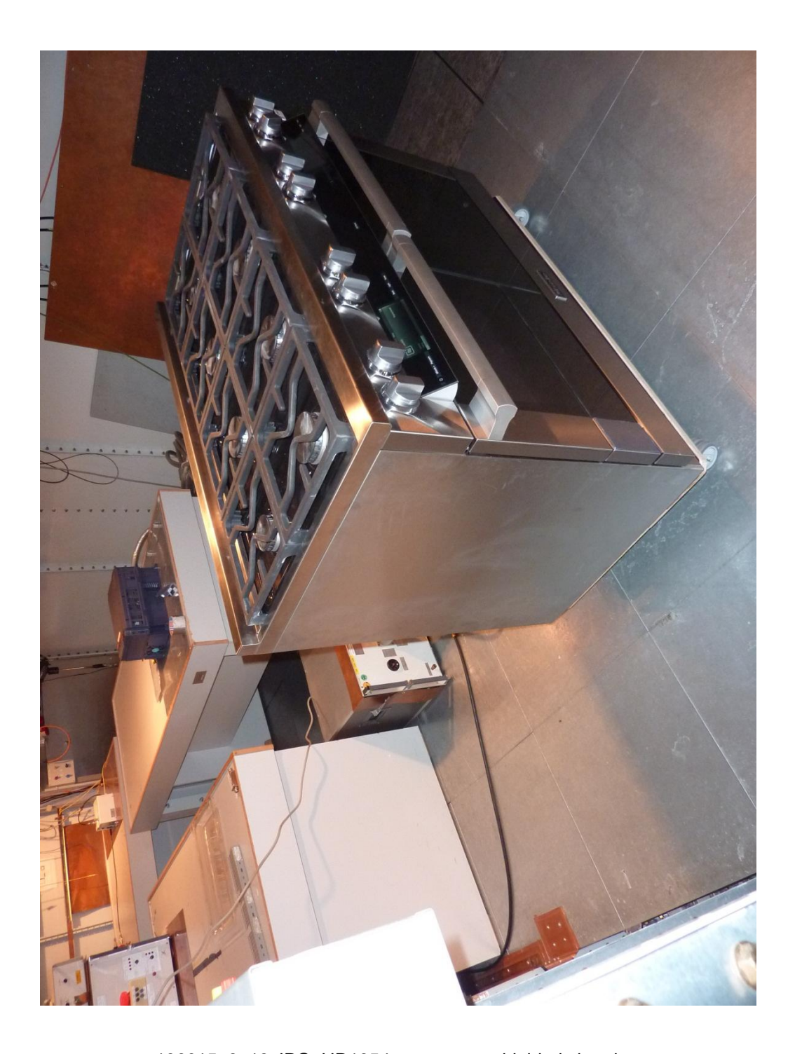
136015_3_13.JPG: HR1954, test set-up shielded chamber

Examiner: Thomas KÜHN Test Report No.: F136015E4, 3<sup>rd</sup> version Date of issue: 30 October 2014 Order No.: 13-116015