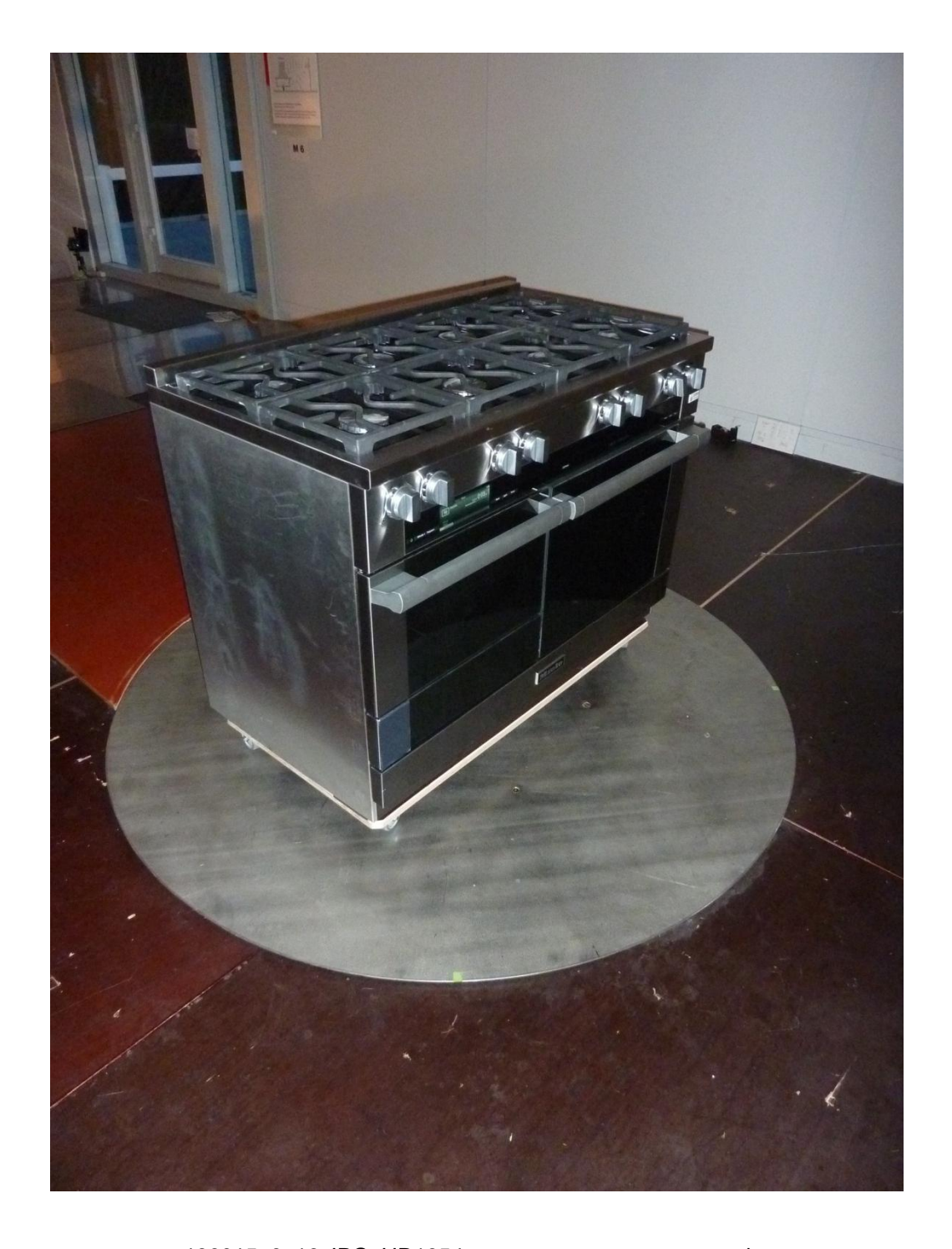
136015_3_16.JPG: HR1954, test set-up open area test site

Examiner: Thomas KÜHN Test Report No.: F136015E4, 3<sup>rd</sup> version Date of issue: 30 October 2014 Order No.: 13-116015