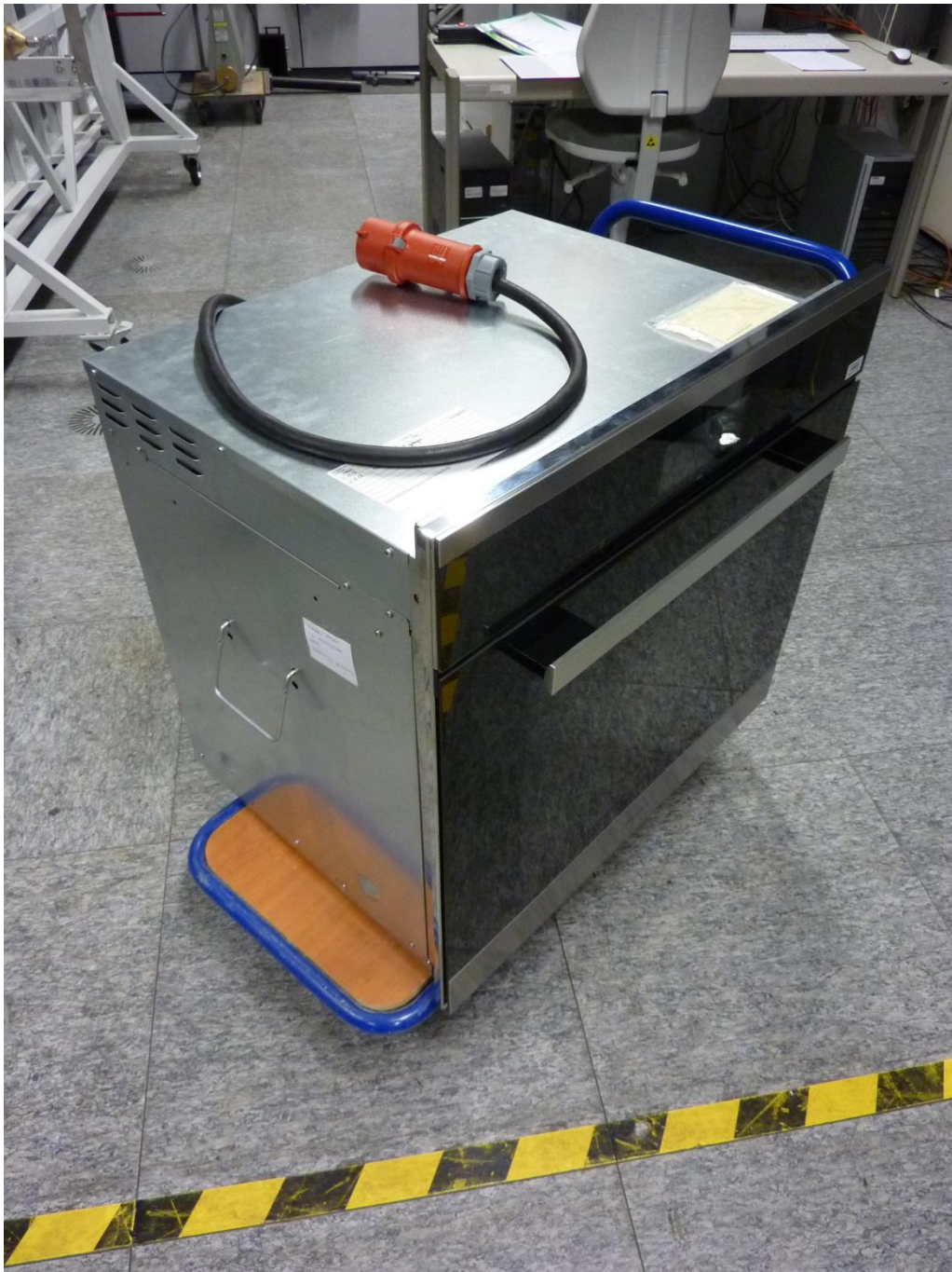
132604_2_m.JPG: H 6880 BP, 3-D-view 1