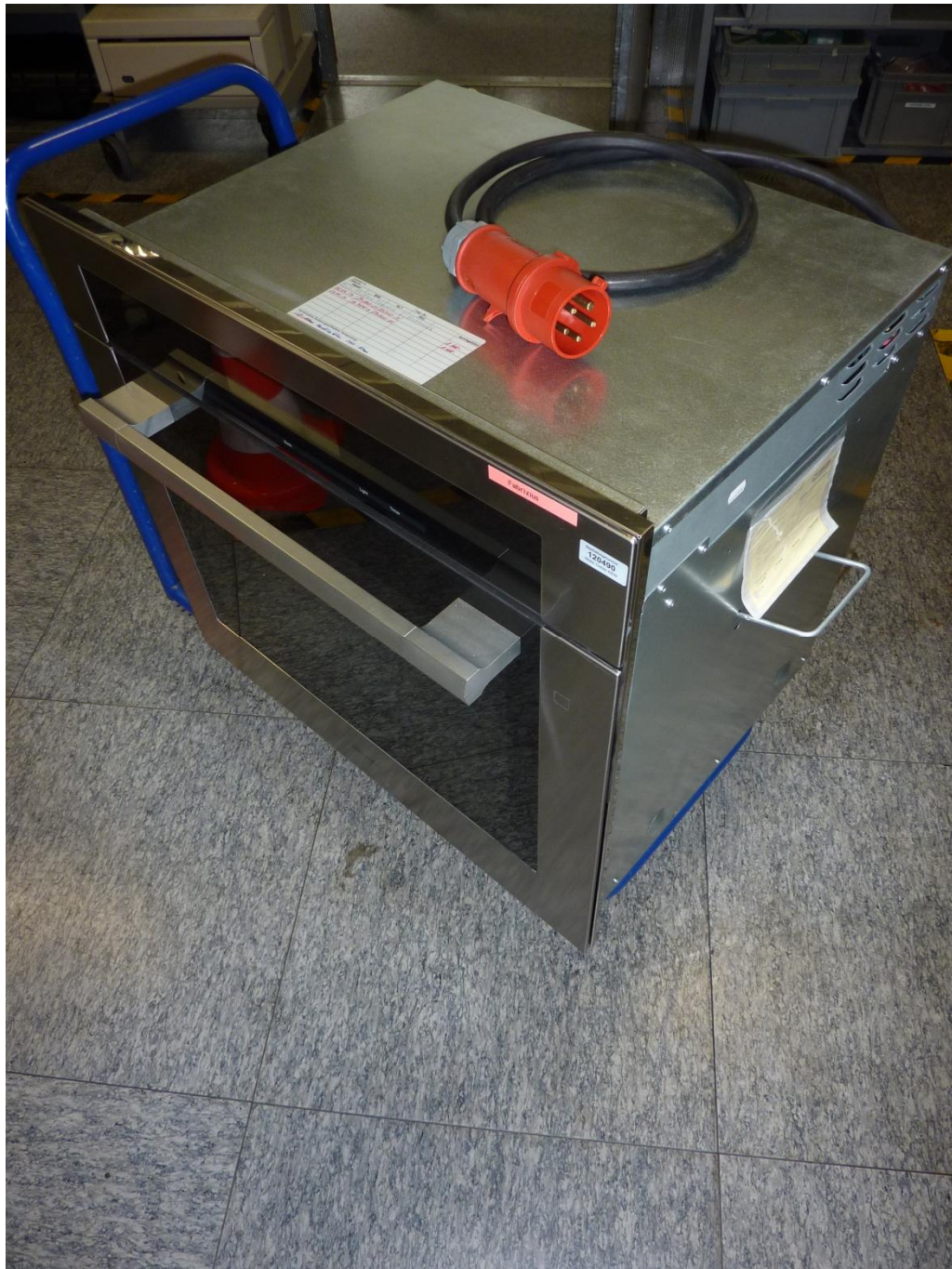
132604_2_a.JPG: H 6880 BP, 3-D.view 2