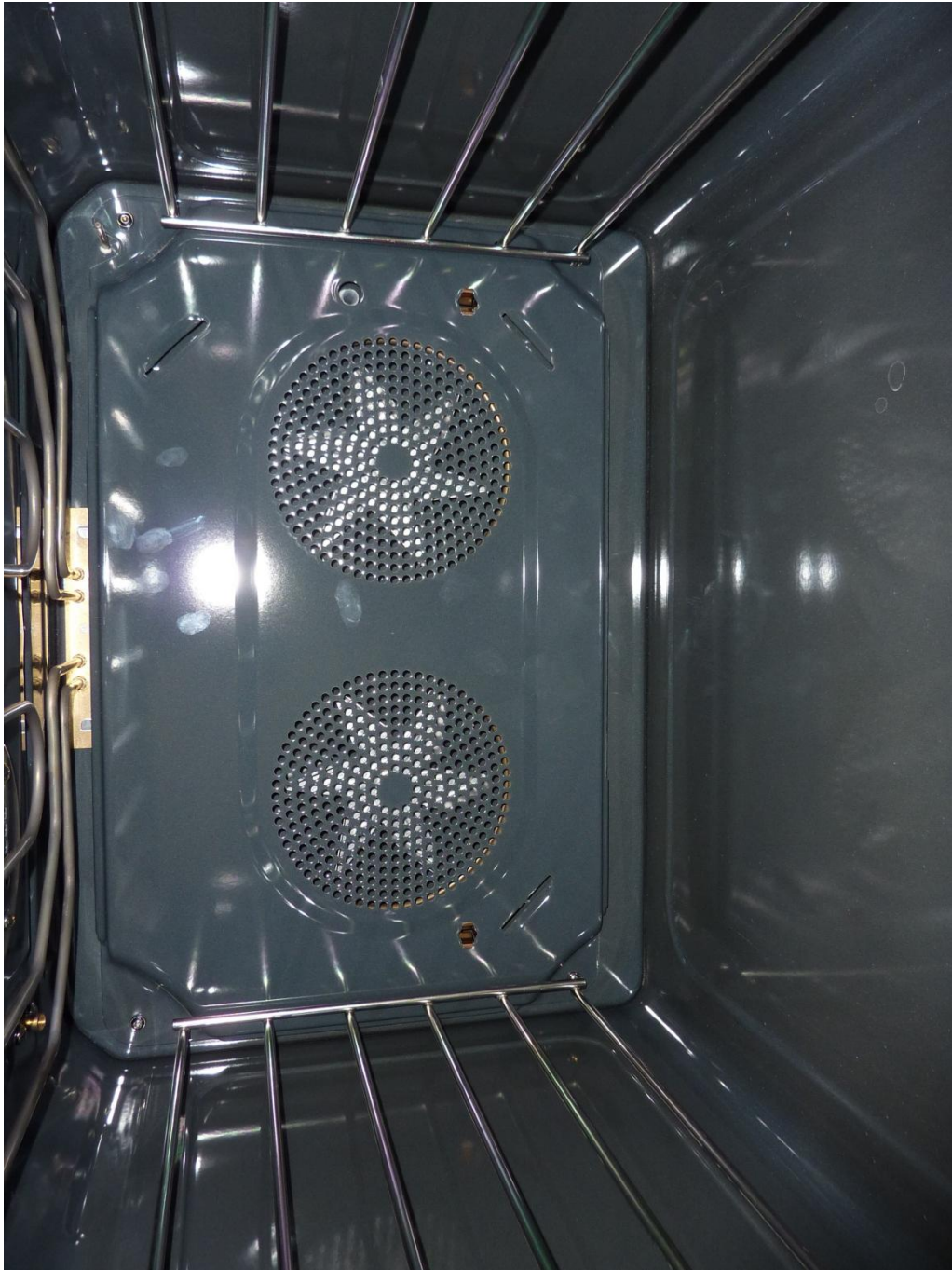
132604_2_I.JPG: H6880BP, cooking chamber (door opened)