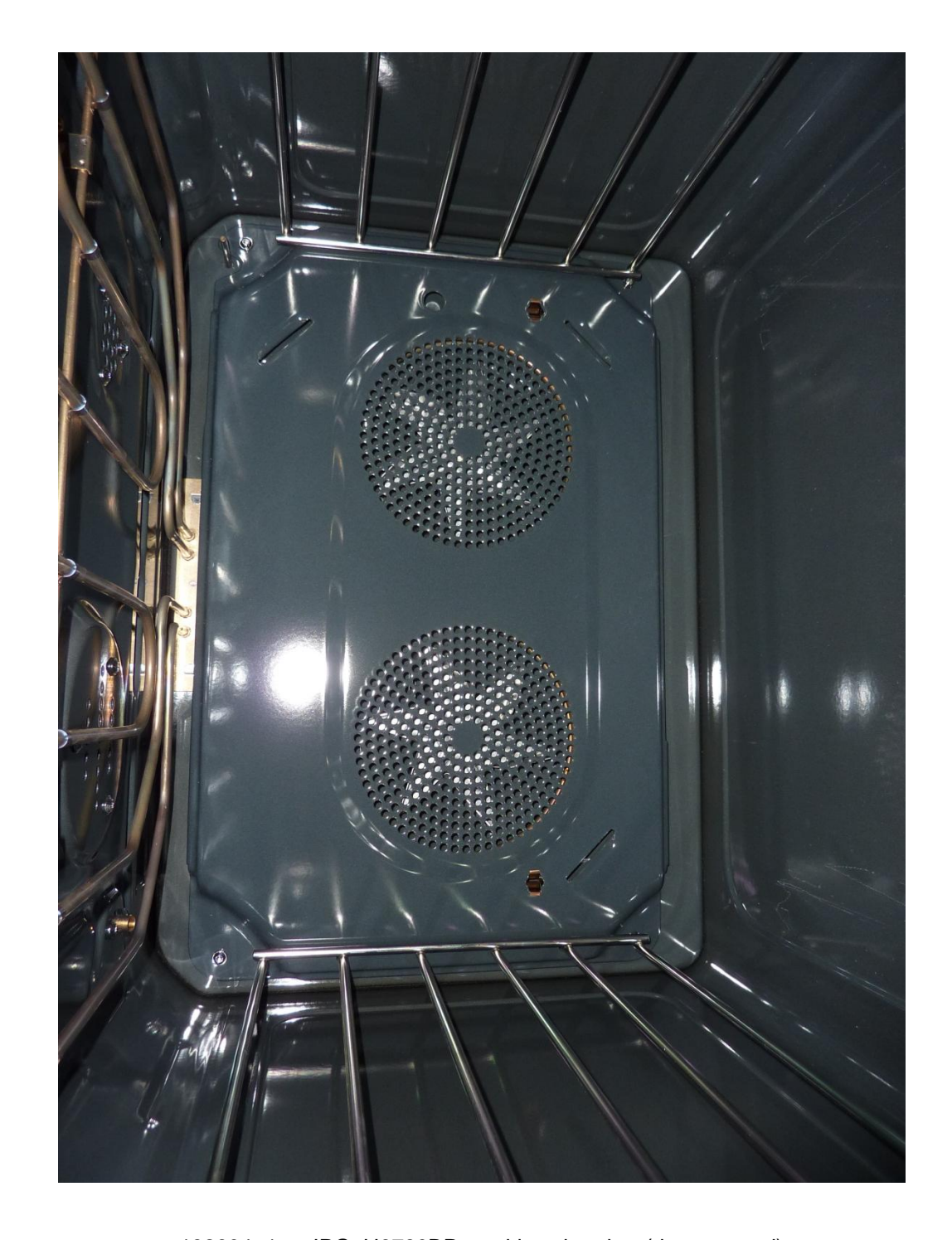
132604_1_n.JPG: H6780BP, cooking chamber (door opened)

Examiner: Thomas KÜHN Test Report No.: F132604E1 Date of issue: 25 October 2013 Order No.: 13-112604 page 3 of 4