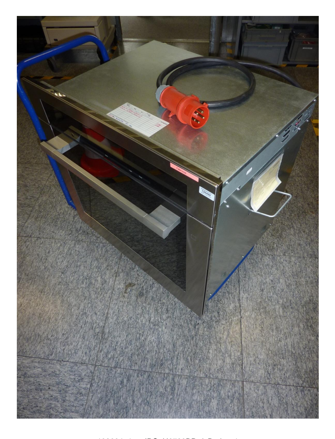
132604_1_a.JPG: H6780BP, 3-D-view 1

Examiner: Thomas KÜHN Test Report No.: F132604E1 Date of issue: 25 October 2013 Order No.: 13-112604 page 1 of 4