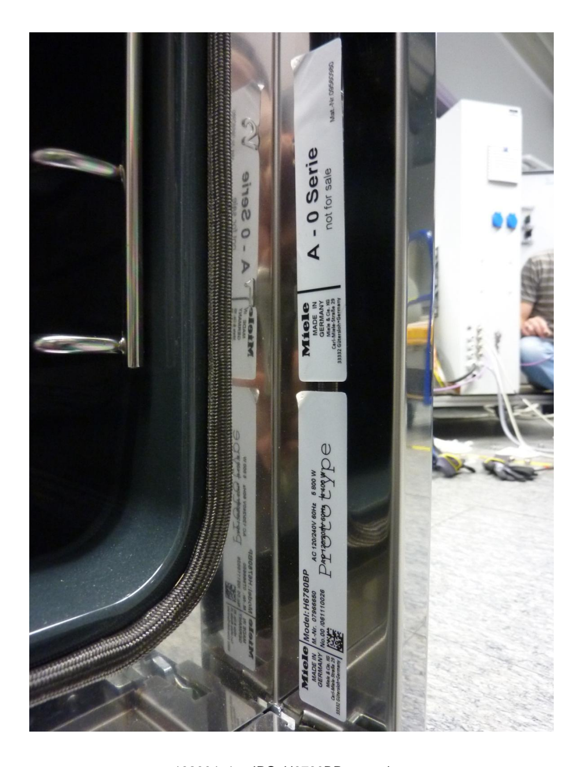
132604_1_t.JPG: H6780BP, type plate

Examiner: Thomas KÜHN Test Report No.: F132604E1 Date of issue: 25 October 2013 Order No.: 13-112604 page 4 of 4